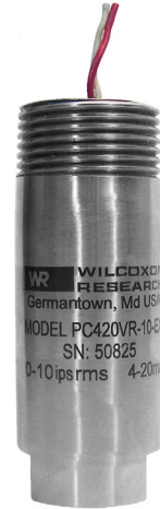
Table 1: PC420Vx-yy-EX model selection guide