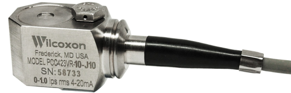
Table 1: PCC423xx-yy-C model selection guide