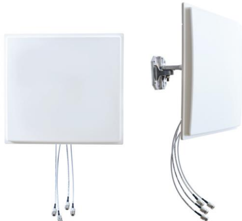
Patent pending PDQ244915