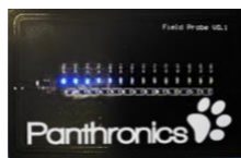
PTX Field Detector Card v1.0