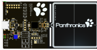
PTX105R EB v1.0