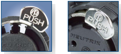
New ergonomic asymmetric locking release tab