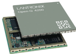
Open-Q™ 4200 SIP Family