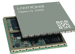
Open-Q™ 2200 SIP Family