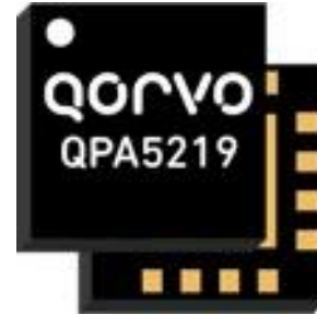
16 Pin 3x3 mm Laminate Package

The QPA5219 integrates a 2.4 GHz power amplifier (PA), regulator and a power detector for improved accuracy.