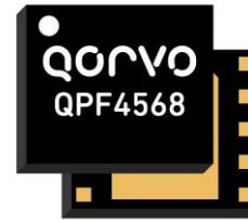
10 Pad 2.0x1.7 mm Laminate Package

The QPF4568 integrates a 5 GHz power amplifier (PA), single pole two throw switch (SP2T) and bypassable low noise amplifier (LNA) into a single device.