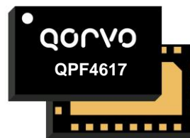
24 Pad 5 x 3 mm Laminate Package