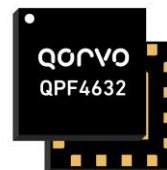
16 Pad 2.5 x 2.5 mm Laminate Package