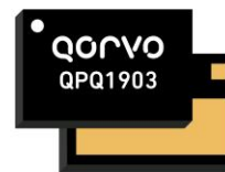
3 Pad 1.7 x 1.1 mm Laminate Package

Using common module packaging techniques to achieve the industry standard footprint while negating as many external passive placements to help end users ease of integration into their circuits.