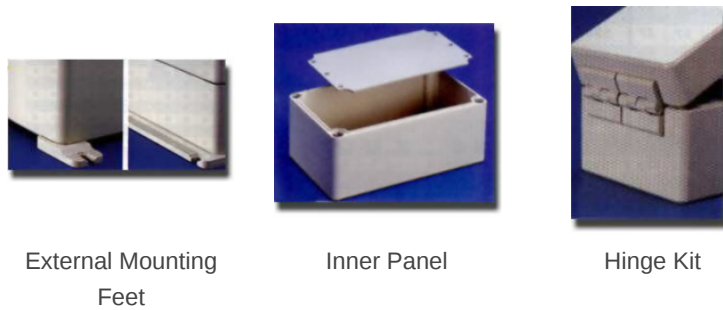
External Mounting Feet