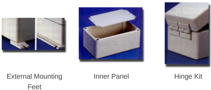
External Mounting Feet