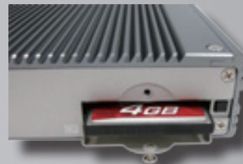
Insert CF card