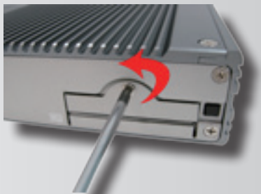
Unscrew and pull down the door