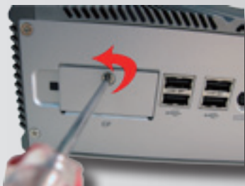
Unscrew and pull down the door