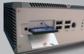
Insert CF card