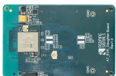
Wireless Daughter Card