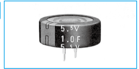
Marking color : White print on a black sleeve