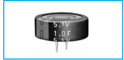
Marking color : White print on an indigo sleeve