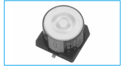
Marking color : White print on an brown sleeve