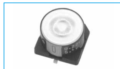
Marking color : White print on an brown sleeve