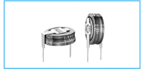
Marking color : White print on an indigo sleeve