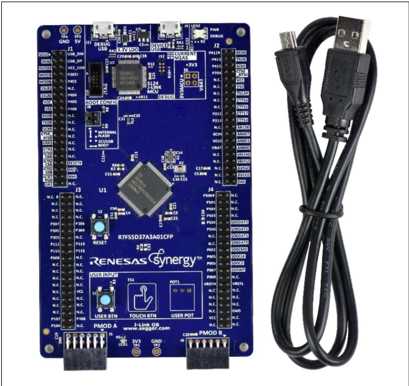
Figure 1. TB-S5D3 Contents