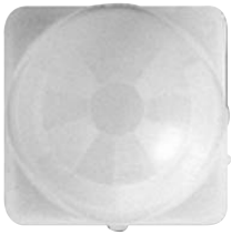
• FRONT SIDE