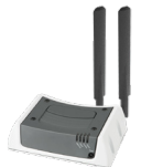
LTE Connectivity Kit