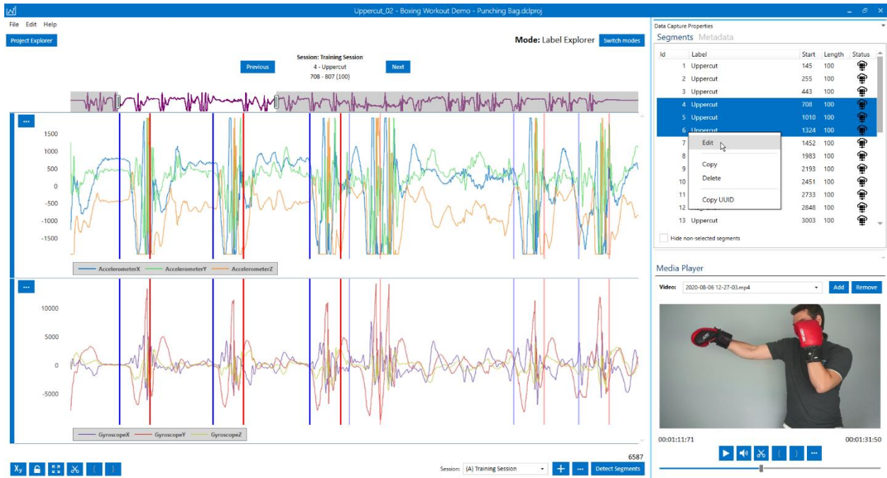
Desktop Data Capture Lab used to label and visualize raw accelerometer sensor data