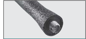
SMA F T2

SMA Female recessed insulator & partial (short) skirt (SFJ type)