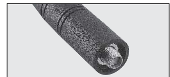
SMA F T3

SMA Female recessed insulator & partial (long) skirt (SFU type)