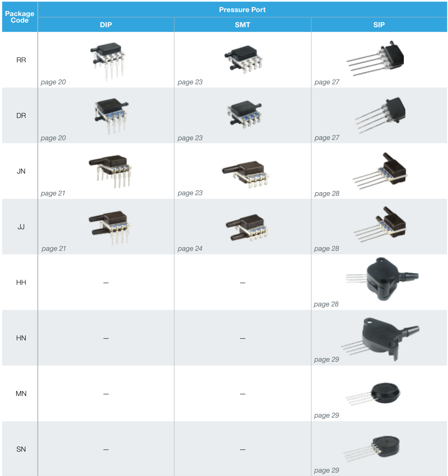
Figure 5. All Available Standard Configurations (Continued; dimensional drawings on pages noted below.)