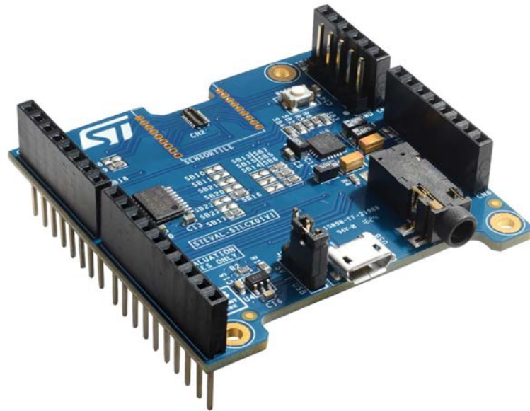
Figure 4. STLCX01V1 board photo