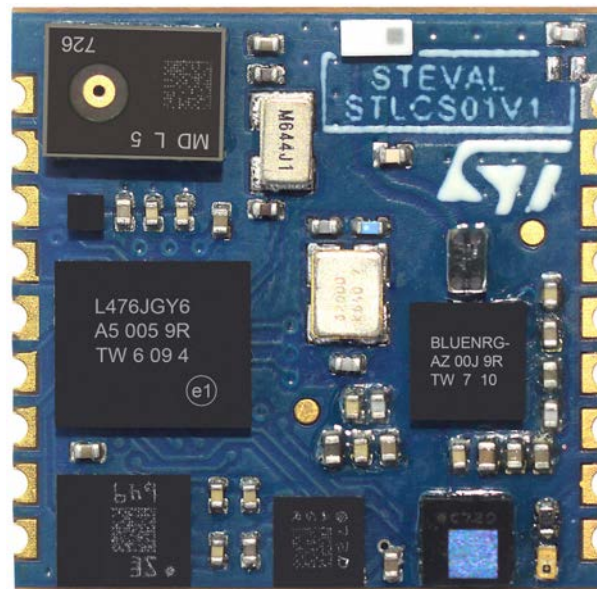
Figure 2. STLCS01V1 board photo