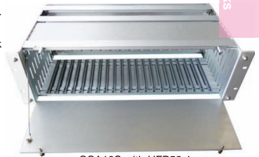
CCA13S with HFP52-1

These are designed for use as a front "drop-down" panel with lanyard for holding the panel at 90°. Provides a work surface and prevents damage to equipment. Comes complete with hardware and full instructions. Panels are 1/8" thick brushed aluminum with clear irridite finish.