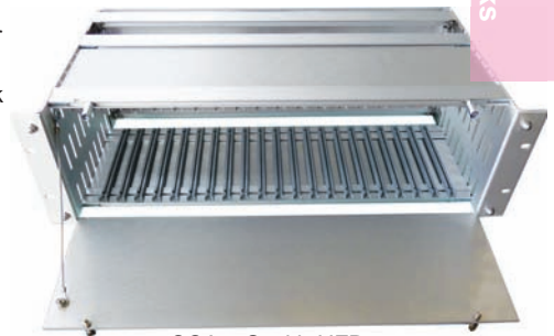
CCA13S with HFP52-1

These are designed for use as a front "drop-down" panel with lanyard for holding the panel at 90°. Provides a work surface and prevents damage to equipment. Comes complete with hardware and full instructions. Panels are 1/8" thick brushed aluminum with clear irridite finish.