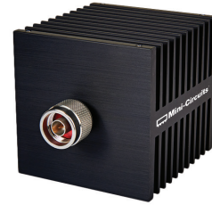
CASE STYLE: LL2798