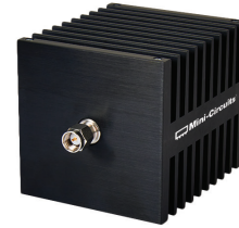
CASE STYLE: LL2798-1