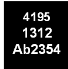
24-L 4x4 mm QFN package

The TGA4195-SM is lead-free and RoHS compliant. Evaluation boards are available upon request.