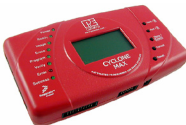
Figure 8-2: P&E's Cyclone MAX