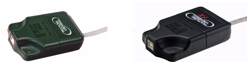
Figure 8-1: Multilink Universal (left) & Multilink Universal FX (right)