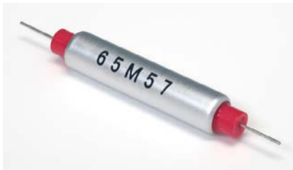
Wire Harness Type