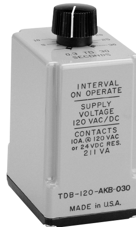
Interval Relay Output