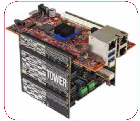
Figure 1. TWR-LS1021A module (TWR-LS1021A, TWR-SER-IO and TWR-ELEV)