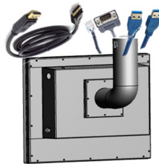
Water and dust proof is easy and reliable with standard cable connectors. No extra cost needed.