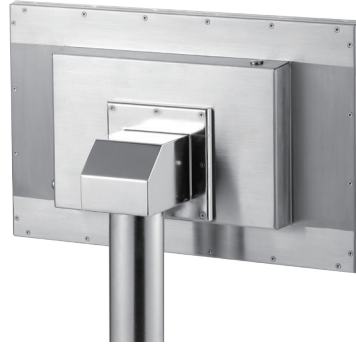
Stainless steel housing for full IP65/IP69K