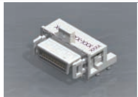
Lanyard latch with top mounting, rear arms U65-H04-40D0-T