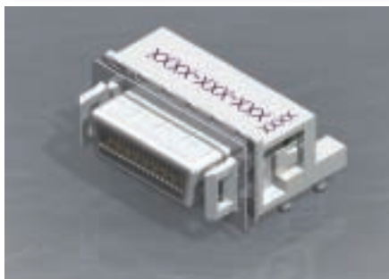
Lanyard latch with rear arms and solder posts U65-B04-40C0-T