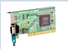
UC-235: LP uPCI 1xRS232