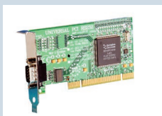
UC-235 LP uPCI 1xRS232