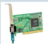
UC-246: uPCI 1xRS232