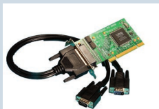
UC-253 LP uPCI 2xRS232