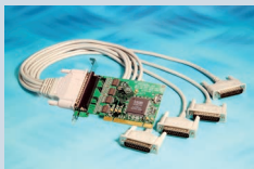
UC-265: uPCI 4xRS232 DB25