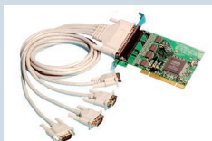
UC-268: uPCI 4xRS232