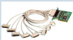
UC-275: uPCI 8xRS232 DB25