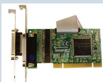
UC-295: uPCI 4xRS232 + LPT Printer Port