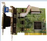
UC-414: uPCI 3+ 1xRS232+LPT Printer Port