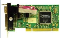
UC-464: LP uPCI 1xRS232 + 1xLPT Printer Port