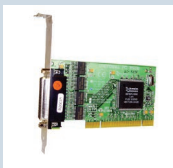
UC-701: uPCI 4xRS232