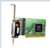
UC-756 uPCI 4xRS232 DB25