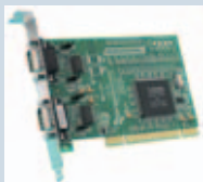
UP-869: uPCI 2xRS232 POS 0.5A