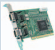
UP-880 uPCI 2xRS232 POS 1A